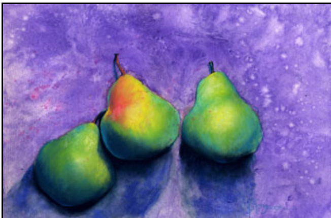
Blush, watercolor and soft pastel, 24" x 20"

This pre-holiday show open to the public will feature at least fifty of the artist's latest works including landscapes and still lifes inspired by her rural Dixmont surroundings. All original works of art will be available for purchase. Reproductions of many paintings will also be available as gift cards and postcards.